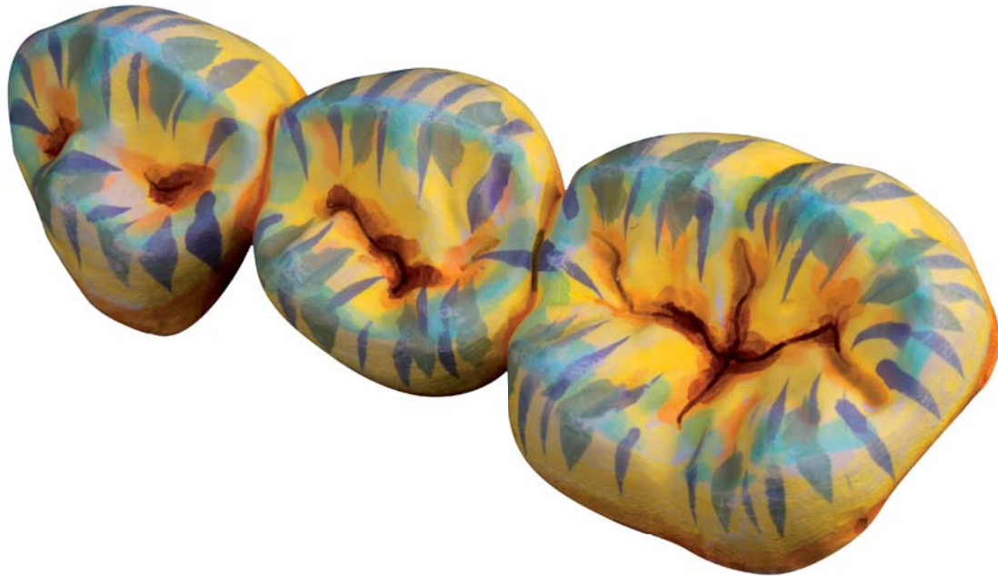
coloured work before the sintering process

The range of Colour Liquid Prettau® Aquarell colours basically corresponds to the 16 colours covering the entire chromatic spectrum of the Vita shades. They are water-based and acid-free. For visual aid, these new liquids contain special burn-out bio-pigments which assist in realistic shade distribution and colour grading. Individual custom colouring of finer details such as mamelons, cervical or interproximal areas is considerably easier and can be performed with pinpoint precision.