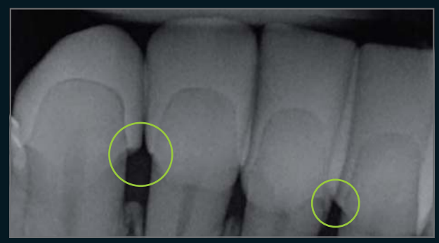
Areas to correct