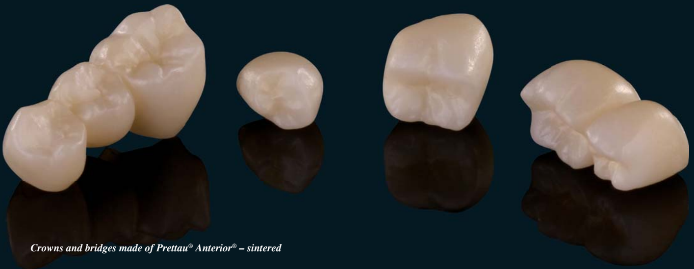
Crowns and bridges made of Prettau® Anterior® – sintered