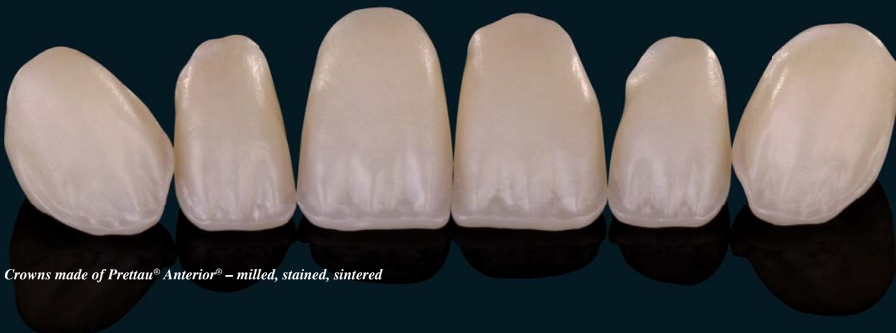
Crowns made of Prettau® Anterior® – milled, stained, sintered