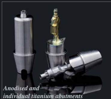
Anodised and individual titanium abutments

From now on, we mill individual titanium abutments for your needs!